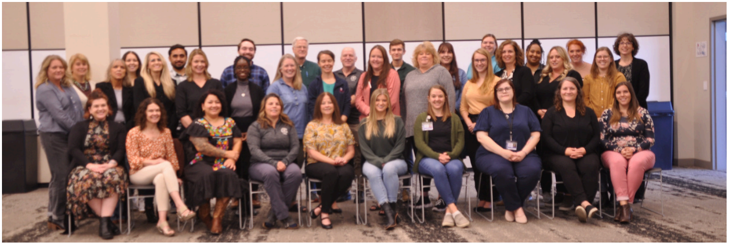
Rock County Public Health staff, October 2024