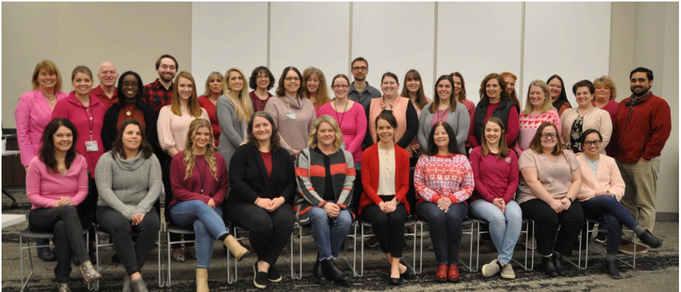
Rock County Public Health staff, February 2024