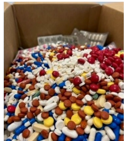
Medication Collected at Senior Fairs, 2023