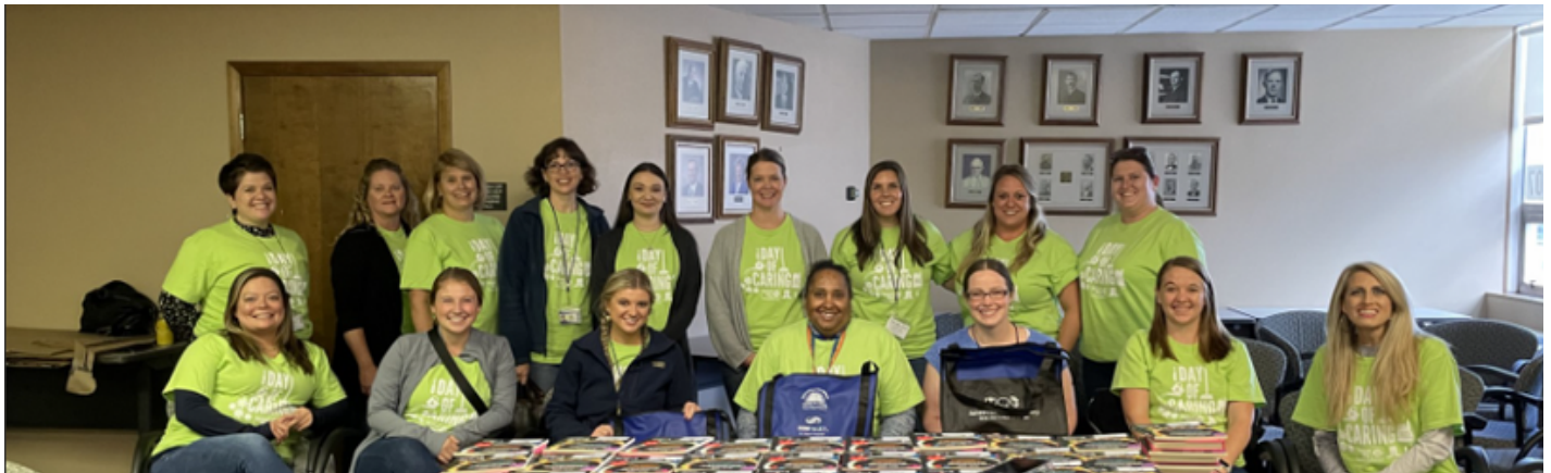
RCPH Staff at United Day of Caring, 2023