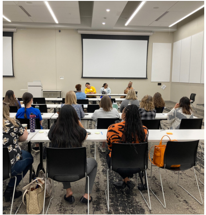
RCPH staff at the Overcoming the Stigma of Addiction Summit (left) and attendees at the Understanding the First 1,000 Days Summit (right)