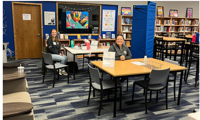
RCPH staff at Fruzen Middle School (left) and Parkview High School (right)