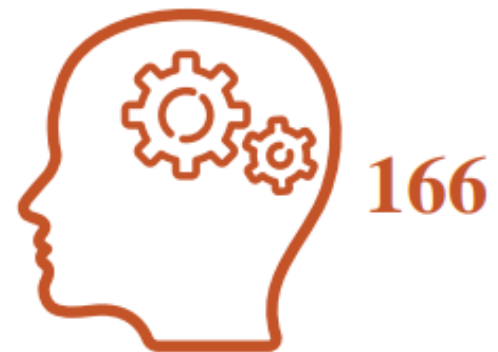
Number of mental health providers per 100,000 people in Rock County