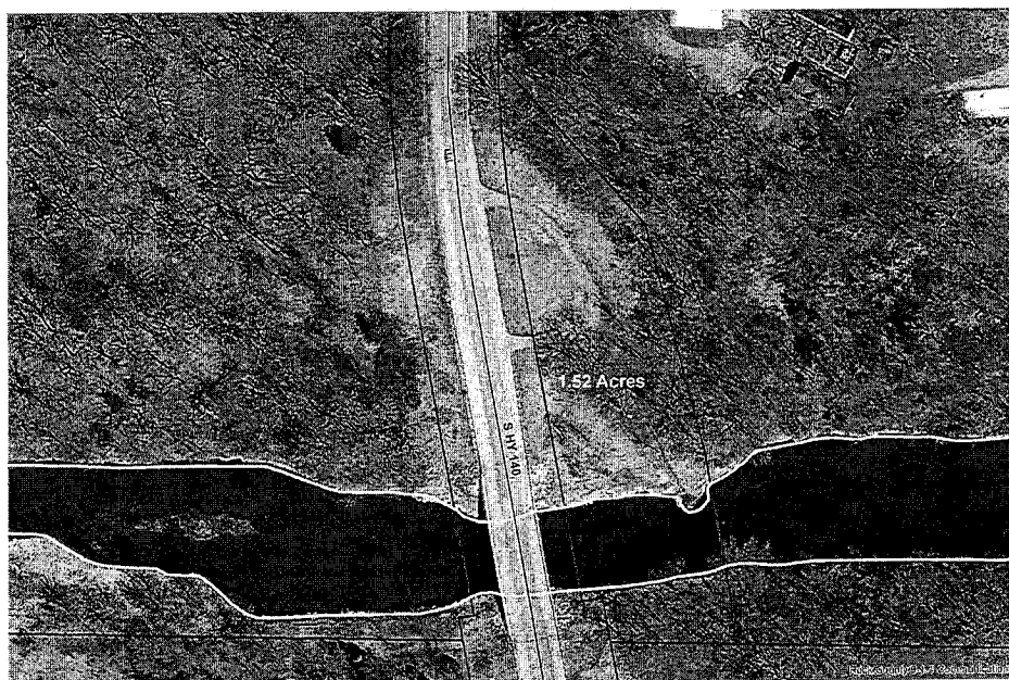
Rye Farms Property 10-4-2016

This purchase is of approximately 1.52 acres of land and an existing paved driveway, parking area, and canoe/kayak launch purchase price of $16,000. We also have a $3,000 commitment of contribution from the Rock County Trail Coalition towards the purchase. The site will require minor modifications and maintenance. The Department has already invested $1,500 on professional services for appraisal and survey work done by the county. Therefore, the total estimated cost of the project is $16,000 and staff time and is within county negotiation parameters. The appraisal was paid for through the Rock County Green Fund.